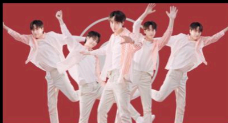
艺人TVC Actor TVC

与众多艺人合作拍摄，超过40+艺人。各种品牌类/促销类/产品类等TVC类型均有验。