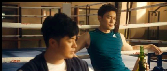
情感故事 Relationship Story

Image building of many brands has been achieved. Create the brand story. An anniversary story has been created to illustrate the brand spirit in the Pepsi Cola's 36th anniversary in China.