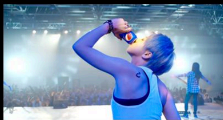
品牌故事 Brand Story

Have cooperated with many artists for shooting with more than 40 actors. We have experience in different kinds of TVC ,such as brand, promotion and product.